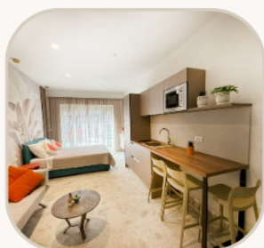
Superior Family Studio 4* (2+1)