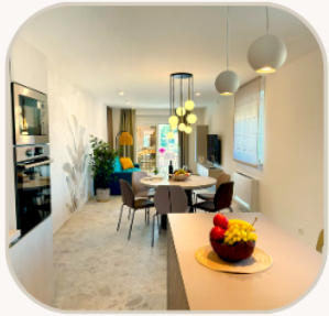
Superior Two-Bedroom Apartment with Sea View 4* (4+2)