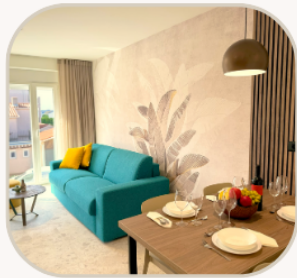
Superior One-Bedroom Apartment Sea View 4* (2+2)