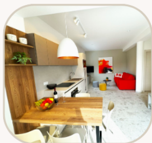
Superior One-Bedroom Apartment Terrace 4* (2+2)